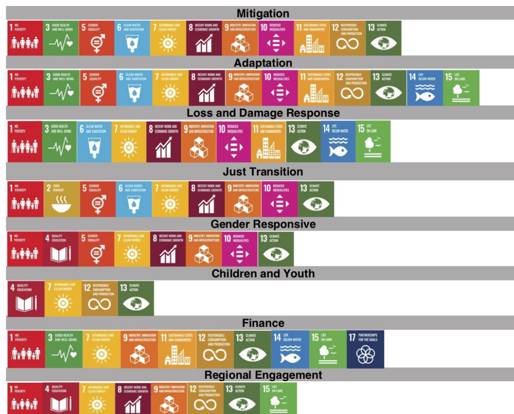
Figure 1: NDC Targets Alignment to SDG Goals

In 2016, Antigua and Barbuda developed a national Medium-Term Development Strategy (MTDS) for 2016-2020 period with a vision of – “a harmonious, prosperous and modern Antigua and Barbuda founded on the principles of sustainability and inclusive growth; where equality of opportunity, peace, and justice prevail for all citizens and residents”. 36 The implementation of the NDC will also assist in achieving the current and future MTDS, which is currently under development. The government has acknowledged that this can only be attained and guided by the four key principles outlined below: