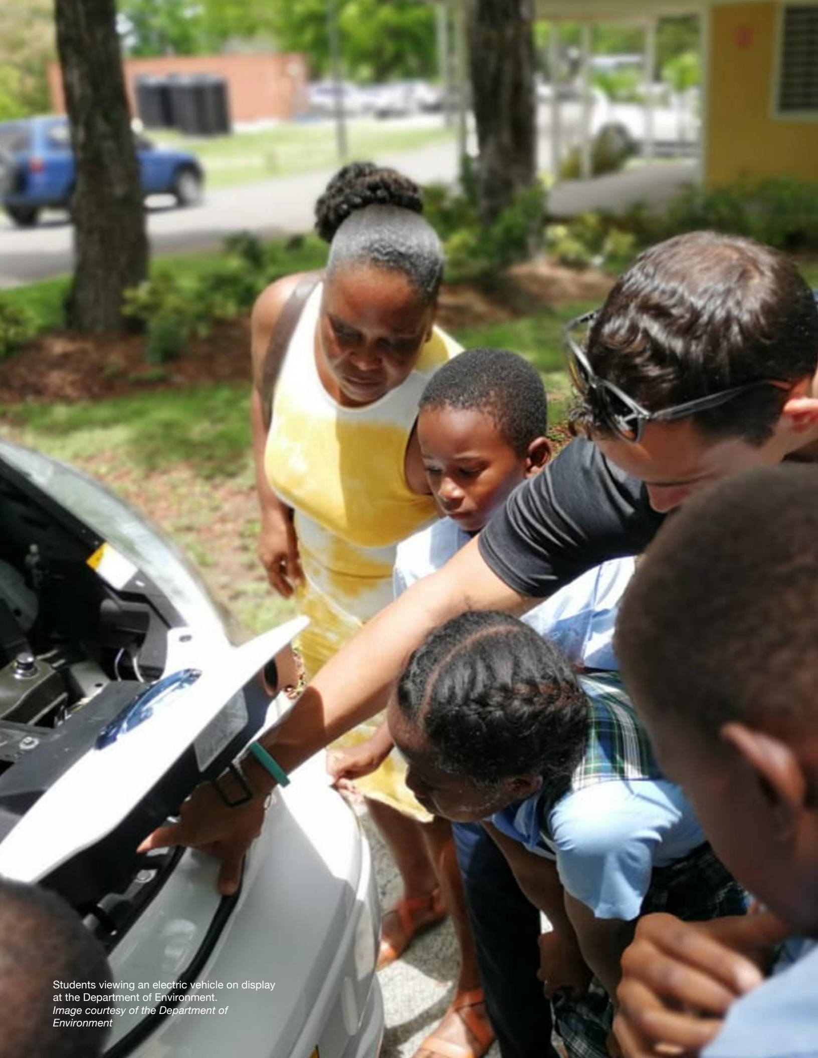
Students viewing an electric vehicle on display at the Department of Environment.