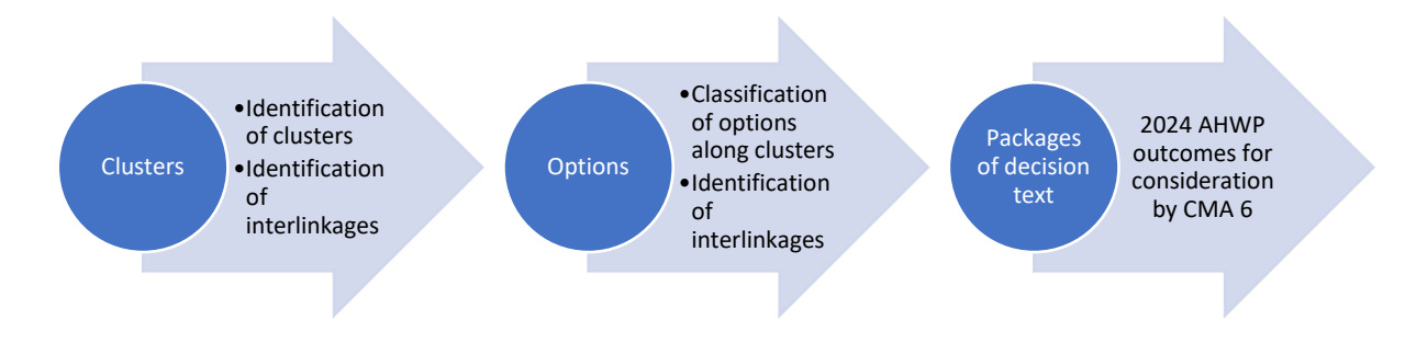
Figure 1 – Main activities and outcome of the 2024 NCQG work plan

To enable the above-mentioned process, we would suggest framing discussions around the following four clusters: 1) Scope; 2) Structure, 3) Quantum and 4) Expected Outcomes.